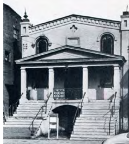
The Cumberland Street Synagogue