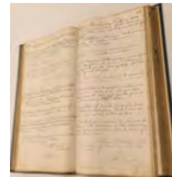
OST Minute Book 1867 - 1880