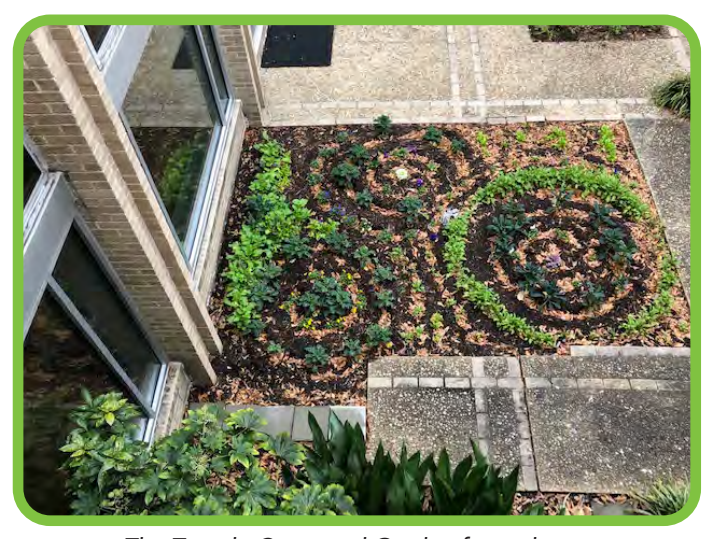
The Temple Courtyard Garden from above.

Many of these plants eventually will be used in our Soup Kitchen while others will be appropriate for Passover. The parsley will be used on the Seder plate. Mustard, arugula, and lettuce can be used for the bitter herbs.