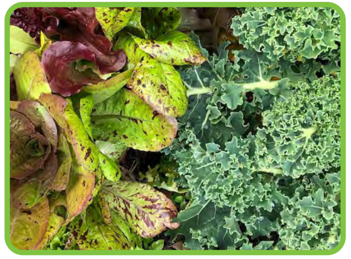
Lettuces with curly kale.

Curly kale has a beautiful rosette growth pattern. Varieties of kale have been developed that have colorful centers. You can see some of these in our