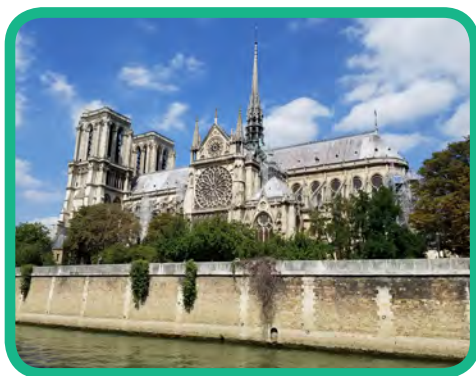
Notre Dame Cathedral, August 22, 2018