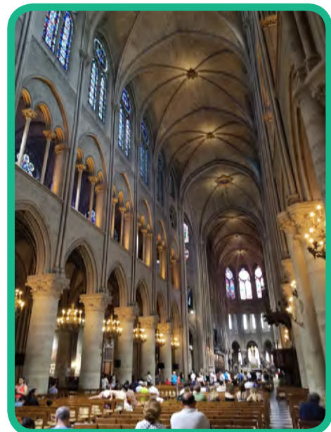
Notre Dame Interior, August 22, 2018

As I reflect on this now, I am so grateful for the sacred space that those who came before us created here at Ohef Sholom, but more so for the spiritual work of nearly two centuries that has happened within it. Like Notre Dame, which has been rebuilt many times throughout history, we have reinvented ourselves over and over again. We have weathered our challenges together, and will continue to do so. Even if, one day, our beautiful building no longer stands, its impact will remain. Creation cannot be destroyed. It can only continue, so long as we are committed to being a part of it. ✧