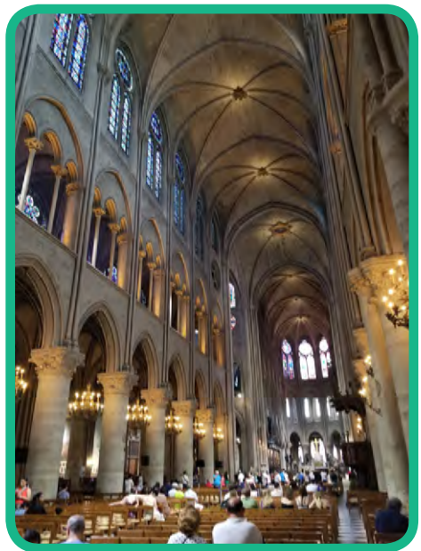
Notre Dame Interior, August 22, 2018

And yet, as we were reminded when Notre Dame burned, even our holy places are not infallible. Our own