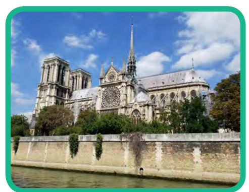
Notre Dame Cathedral, August 22, 2018

But why did this particular tragedy feel so visceral? After all, this was not "our" tragedy.