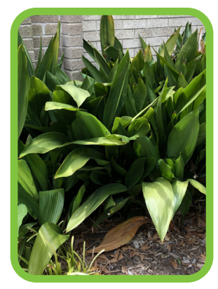
Tough as Nails (or Cast Iron Plant).

team is working on reducing the amount of this plant in the atrium. We have transplanted clumps of it in other areas around the Temple grounds and plan to continue this process but there are more plants than we can use. These plants are great for areas under trees where not much will grow. They require very little care. We will be putting the extra plants at the back of the Temple past the dumpster