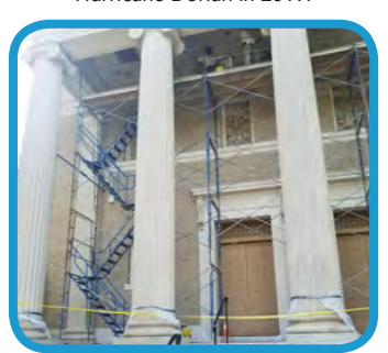
To repair the soffit, a metal work scaffold was erected, including a temporary access stair.