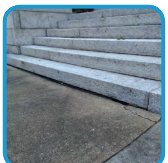
The gap between the concrete walk and the stone stair riser had become a tripping hazard.