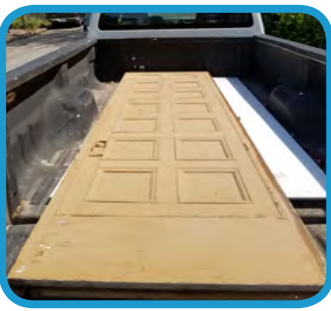
Each door leaf was taken off-site for repair and refinishing.