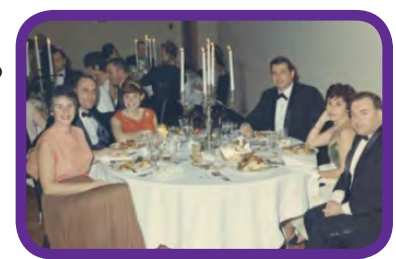
Congregants enjoy music, food, and being together at the 1970 Jewel Ball.

of holding interfaith Thanksgiving services continued, and in 1976 and again in 1980, the congregation organized and participated in an interfaith Seder.