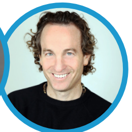
Filmmaker Dani Menkin

Watch the film anytime between now and October 6 with this link and password: https://vimeo.com/208277408 PW: OTM22