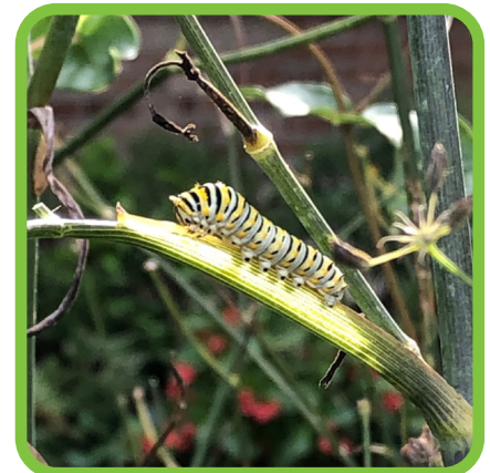
By not removing stems, branches, and leaves, spaces are provided for animals like the swallowtail chrysalis to shelter for the winter.

We are at the beginning of the New Year. This is a good time to reflect on what is changing in the natural world and find purpose, peace, and renewal from it. "In with the new." We plan and plant. "Out with the old." We trim, weed, harvest, and pull. Repurpose what you can. We compost, save seeds, use rain barrels, reuse, repair, and try to minimize our footprint on God's earth.