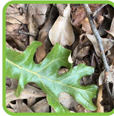
Leaves provide a protective layer for the soil and tender plants.

A word about those pesky leaves that are falling and covering your yard and streets. The traditional plan was to rake them up and throw them away