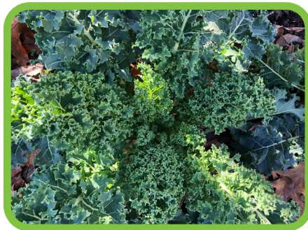
Curly Kale is one of the plants that can survive temperatures below freezing.

One group of plants can live in temperatures as low as 32 degrees and can withstand a light frost. This group includes beets, carrots, lettuces, and potatoes. The other group, which includes kale, collards, mustard, spinach, parsley, and broccoli is extremely hardy and can tolerate temperatures as low 20 degrees. Most of these crops have more flavor after a frost.