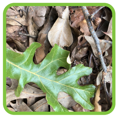
Leaves provide a protective layer for the soil and tender plants.

A word about those pesky leaves that are falling and covering your yard and streets. The traditional plan was to rake them up and throw them away