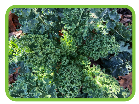
Curly Kale is one of the plants that can survive temperatures below freezing.

One group of plants can live in temperatures as low as 32 degrees and can withstand a light frost. This group includes beets, carrots, lettuces, and potatoes. The other group, which includes kale, collards, mustard, spinach,