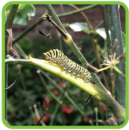
By not removing stems, branches, and leaves, spaces are provided for animals like the swallowtail chrysalis to shelter for the winter.

We are at the beginning of the New Year. This is a good time to reflect on what is changing in the natural world and find purpose, peace, and renewal from it. "In with the new." We plan and plant. "Out with the old." We trim, weed, harvest, and pull. Repurpose what you can. We