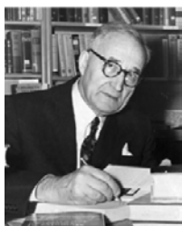
Rabbi Jacob Rader Marcus

Listening to the recordings or reading the transcripts provides a doorway to the past. We hear of OST's efforts to raise money to rescue Jewish refugees from Nazi-occupied Europe. We learn of interfaith efforts to help the USO. We learn of the temple president who enlisted in World War II even though he could have obtained a medical waiver. On a lighter note, we learn of the temple president who admitted that he moved to the South from Minnesota, where the temperature in winter could fall to 42 degrees . . . below zero.