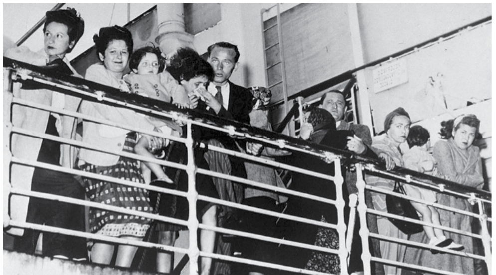
Belgian Jewish passengers of the S.S. Quanza , docked in Norfolk harbor, 1940, while their fate hangs in the balance, prohibited by US immigration law from disembarking, and stayed by a US court in Norfolk from voyaging back to Nazi Europe.