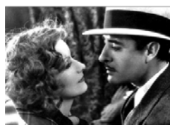
Garbo and Gilbert

Hebrew name at breakfast. Most Jews are given their Hebrew name in a temple ceremony, but for this OST president, it was in a hotel dining room.