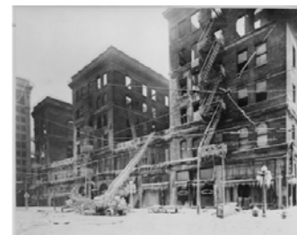
After the fire that destroyed the original hotel in 1918.

Serious or humorous, the stories reveal much about the people and events that shaped our community and continue to have an effect on the kind of house of worship and congregation we are today. Watch for more glimpses from the past in future issues of the Temple Post -- lessons for the present from voices of the past in OST's wonderful Oral History Collection.