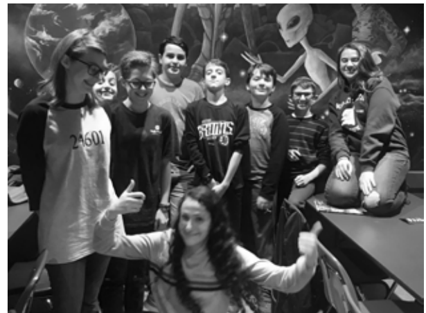
OSTY (and a few siblings) pew-pewed their hearts out at Laser Tag on Jan. 28. They learned strategy planning, teamwork, and came up with witty code names.