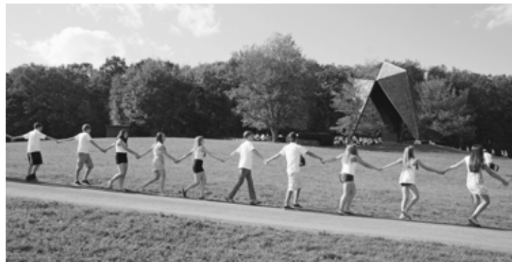
Walking to the chapel at URJ Camp Harlam, Kunkeltown, PA.

Reference guide to many other camp scholarships