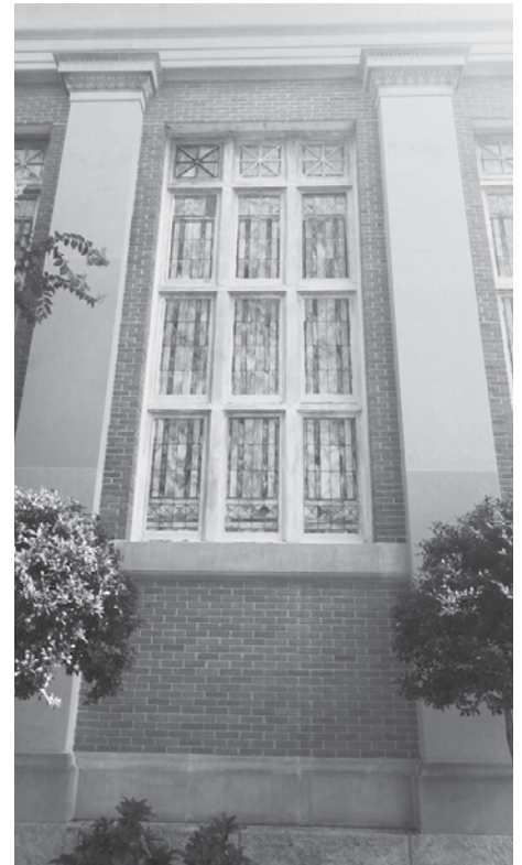
A typical panel of the OST sanctuary stained glass windows.

This summer, you may have seen skilled workmen providing wood