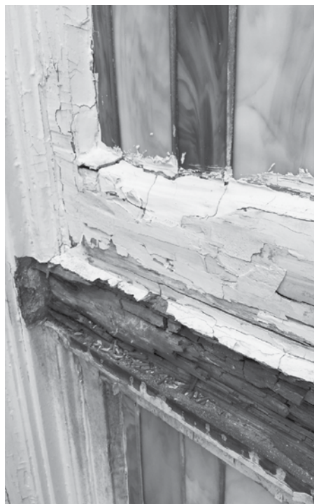
Close-up view of the deterioration to stained glass window wood framing, due to water damage

Our bodies are constantly aging. From the moment we are born until we die, our own physical bodies are affected by gravity, weather, mechanical damage, and repetitive usage. Our skin wrinkles and cracks; our breathing becomes shallower; our reaction