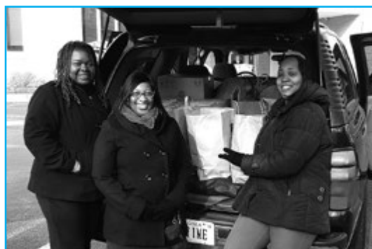
Chesterfield Academy Teachers load up the donations