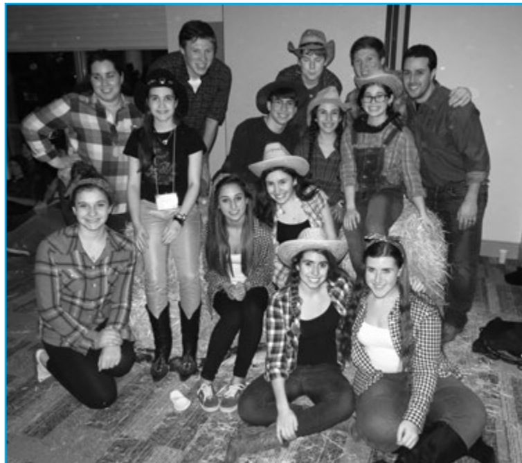
OSTY at NFTY-MAR Fall Kallah in Raleigh, North Carolina, November 22-24, 2013.