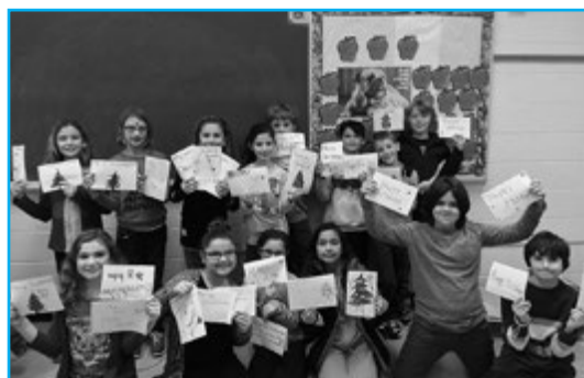
4th Grade Religious School Class