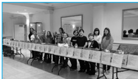
6th Grade Religious School Class