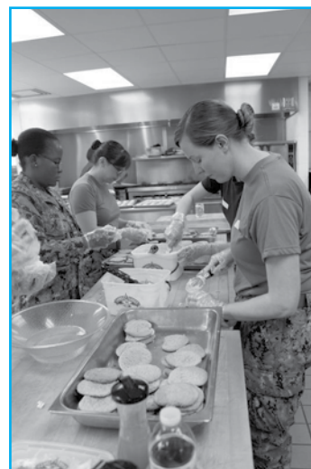
Making ice cream sandwiches.