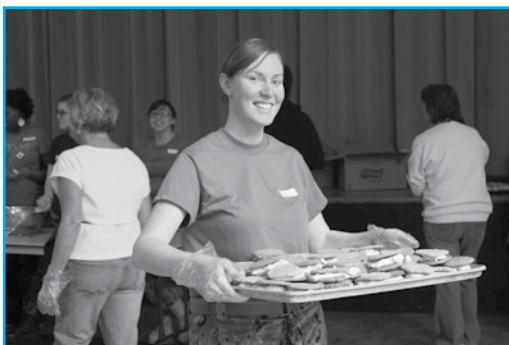
We prepared homemade ice cream sandwiches for dessert, and the sailors enjoyed going around to the tables to serve them and chat with our clients.