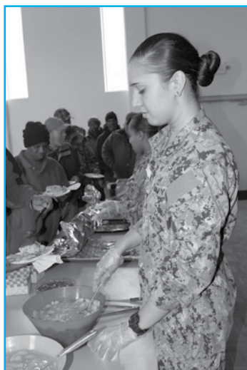
The sailors and Macy's Associates kept the serving line moving and received many thanks from our clients.

At our last Soup Kitchen meal, we welcomed nine sailors from Assault Craft Unit Four and Commander Naval Beach Group Two and five Sales Associates from the Chesapeake Macy's. Many thanks to these generous people; it was an honor to work side by side with them in the service of others.