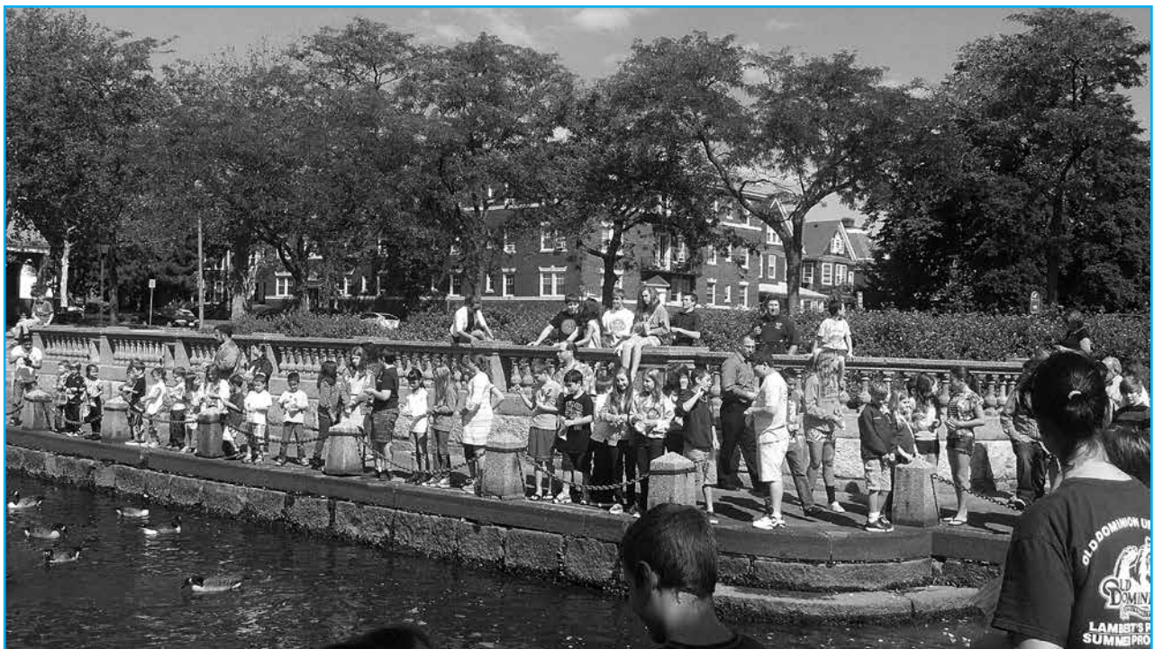
Tashtlich at The Hague