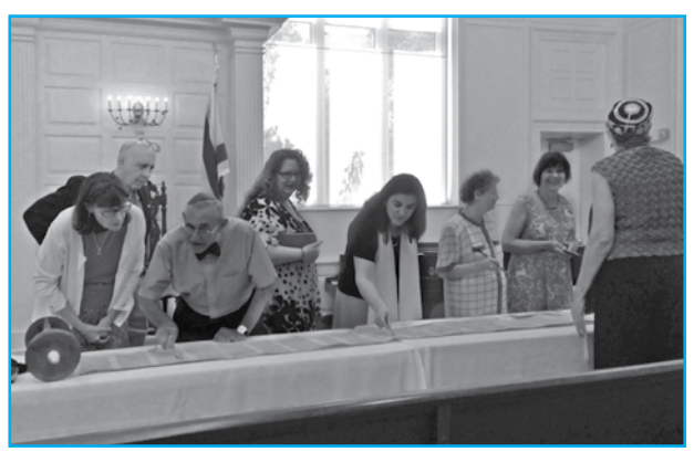
The group uses the yad (pointer) to point out words they recognize in the Torah.

hef Sholom Temple recently held a series of Learner's Services (sponsored by the Interfaith Committee) to help those new to Judaism and seeking insight to learn more about the customs and traditions of a Shabbat Service.