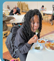
Smiles all around from the guests enjoying their meal.