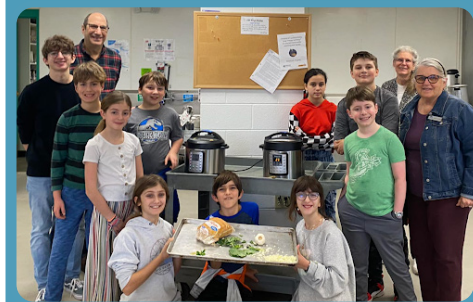
Religious School students and Eco-Judaism Committee team up to harvest, clean, and cook collards.