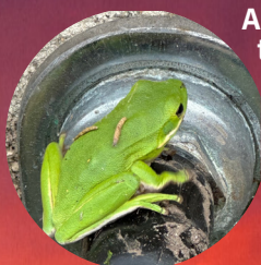
A green treefrog makes a visits to Ohel Shalom.

As I am writing this there is a storm with the sound of heavy rain and loud thunder. In Jewish tradition thunder and lightning are reminders of G-d's power and are given special prayers. As a result of the rain a chorus of toads and frogs begin to perform an unruly chorus of sounds and rhythms. Are they saying, "I am here" as they advertise for a mate?