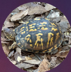
The patterned shell helps the eastern box turtle blend in with its surroundings.

This is summer with its variety of insects that buzz and click. The cicadas and grasshoppers can not be ignored because of their volume. If you look quickly toward the rustling leaves you may see a blue tailed skink as it rushes along or observe a slow paced endangered box turtle. The buzzing may be a mosquito, fly, or a bee seeking a meal.