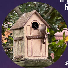
A house wren brings food to its family.

If you wake up around 4AM you may hear a bird singing loudly, wonder why it would sing in the dark, and wish that it would stop. As dawn comes that bird is joined by a chorus of other birds. Some have lovely melodies like the wren, wood thrush, and brown thrasher. The hawk and egret may add their sharp calls. Chatty crows have varied sounds and may participate. Some bird calls are simple, using one or a few