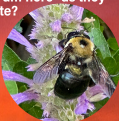
A solitary bee gathers food from the agastache flowers.

Paying attention can reward us with the many wonders found in the natural world. Perhaps this is G-d's way of saying to us, "Here I am."